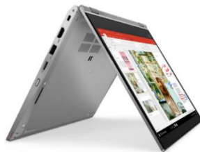
Lenovo Thinkpad L13 Yoga A beautiful 13.3" Convertible Tablet / Ultrabook with stylus and Touch

This device will have the option to include 3 year Accidental Damage Protection Insurance or Accidental Damage Protection with Loss and Theft Insurance, which is strongly recommended to cover the device, as ongoing repairs to devices can prove to be very expensive. Any device not covered by the Insurance Plan listed above would be the responsibility of the owner and their insurance company (if applicable).