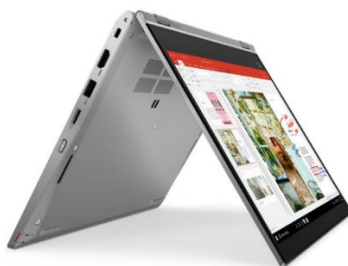
Lenovo Thinkpad L13 Yoga (Gen 2) A beautiful 13.3" Convertible Tablet / Ultrabook with stylus and Touch

This device will have the option to include 3 year Accidental Damage Protection Insurance or Accidental Damage Protection with Loss and Theft Insurance, which is strongly recommended to cover the device, as ongoing repairs to devices can prove to be very expensive. Any device not covered by the Insurance Plan listed above would be the responsibility of the owner and their insurance company (if applicable).